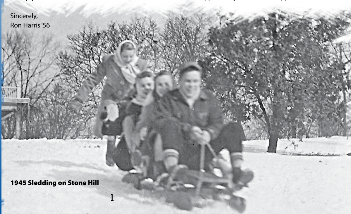
1945 Sledding on Stone Hill