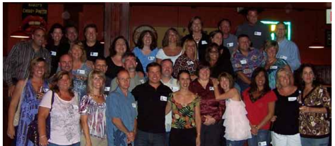
Class of 1985 Alumni and families gathered at the UA Thompson Park in during their 25 th reunion weekend festivities.