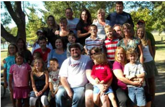
Class of 1985 Alumni and families gathered at the UA Thompson Park in during their 25 th reunion weekend festivities.