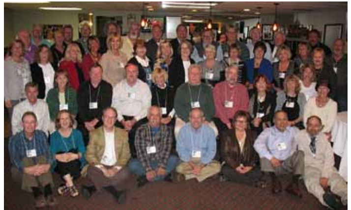
The Class of 1970 enjoyed a 40 th reunion weekend with a recent get together at the Knotty Pine one Friday night followed by a party at the Columbus Italian Club